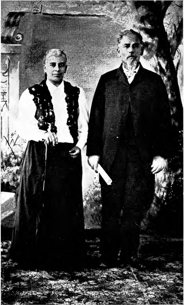
FIRST FRUITS OF THE NEW MISSION